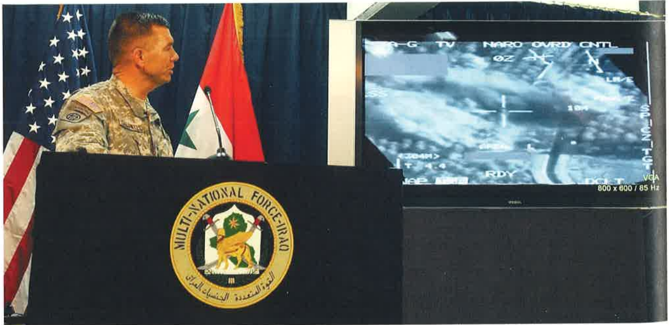
Modern technology makes spying much easier than in the past. This satellite image shows an al Qaeda training camp hidden in the mountains of Afghanistan. The camp was later destroyed by U.S. air strikes.

It’s the importance of finding out what they’re planning ahead of time. That is the task of intelligence, and you have to have a very special kind of intelligence to do that; and you have to understand that this is going to involve spying. And it’s going to be attacked by some people as a dirty business. What it is actually [doing] is giving a democracy eyes. And without eyes, the democracy’s not going to remain a democracy very long.