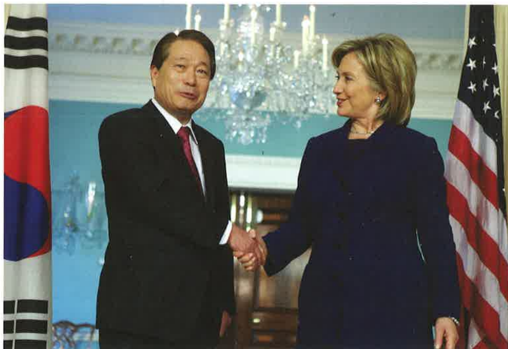
Hillary Clinton served as U.S. Secretary of State from 2009–2013. During her term she visited over 100 countries to carry out duties such as negotiating treaties. Here, Clinton visits with South Korean Foreign Minister Yu Myung-hwan in February 2010.

Intelligence. This section includes the Central Intelligence Agency and the National Security Agency (NSA). Both the CIA and the NSA work to provide Congress and the executive branch with reliable information about other countries and possible threats to vital U.S. interests.