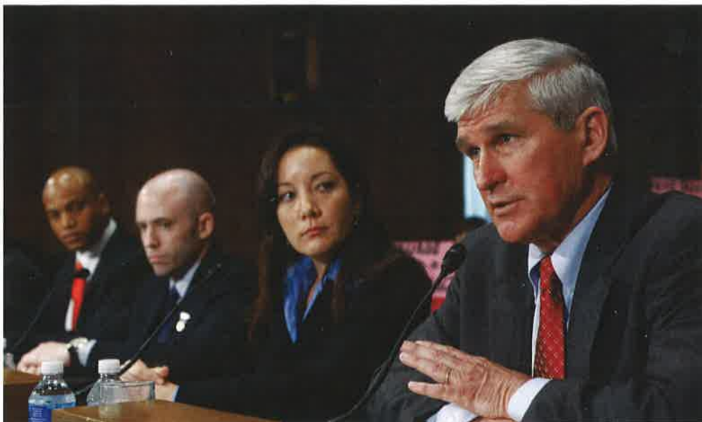
This photograph shows Andrew Bacevich, a retired army colonel, testifying before the Senate Foreign Relations Committee in April 2009. He and other veterans of the Afghan War testified together to offer advice to policymakers.

In times of war, Americans tend to “rally round the flag” and their fighting men and women. However, support for the troops may not extend to the policies that led the nation into war. Such had been the case in Iraq, as U.S. casualties mounted month by month. A CNN/ORC Poll completed in December 2011 revealed that 66 percent of Americans opposed the war in Iraq. This number was an increase from